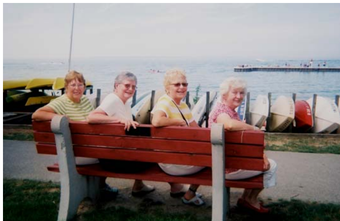
Lakeside Takes a "Turn" for the Better.