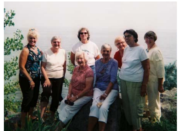
Our ladies grace Lake Erie shore

The women work very hard and have traditional roles and jobs like Americans in the 1950's and 60's, such as clerical work. Gender roles are very divided. Interestingly, the nursing profession is mostly filled by men. Many older Palestine-Israeli women cannot read. Now, in the younger generations, education is much more stressed. Women who marry must be very compatible with their husband's family or the marriage won't work, because the families stay close-knit. Adult women don't go swimming and even some girls wear scarves in the pool. Rules are: "No knees, No shoulders, No cleavage!" At home with their families, friends and neighbors, the women take off their long head scarves and many wear western clothes under their long garments. There is much variety in clothing.