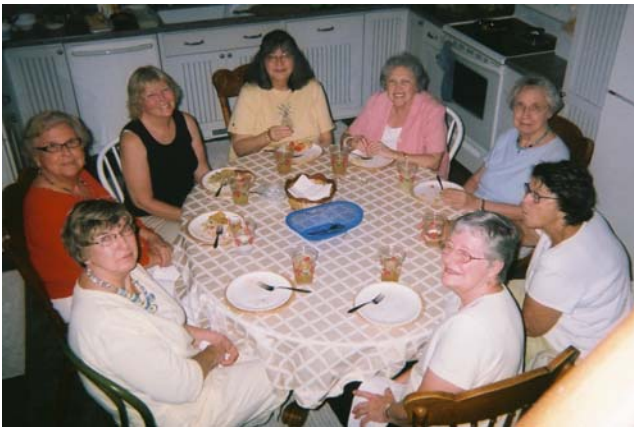
Ladies of the Round Table