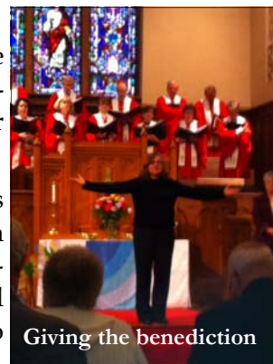
Giving the benediction