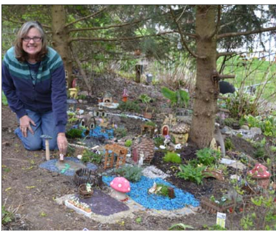
The Fairy Garden