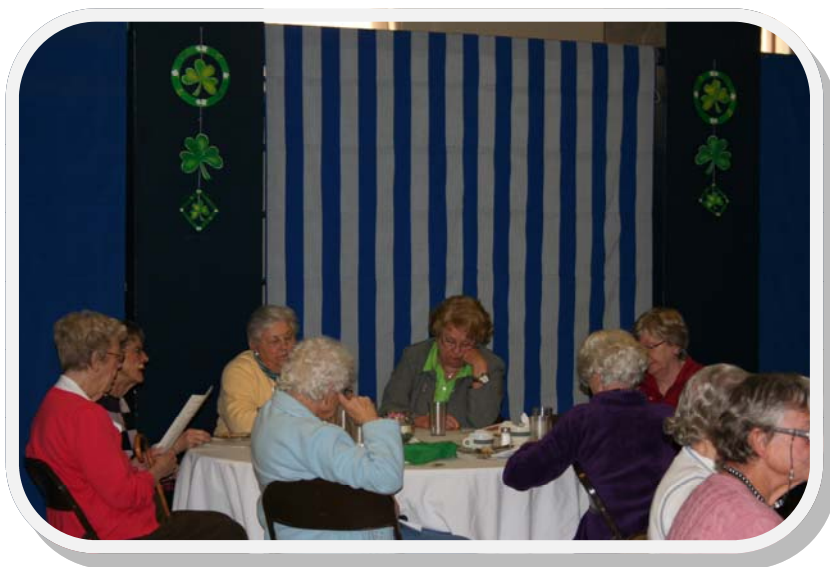
Intently listening to items being presented during the General Meeting.

The Three Rivers UMW Spring meeting will be Saturday, April 27, registration at 9 a.m. cost is $7.00 with lunch.